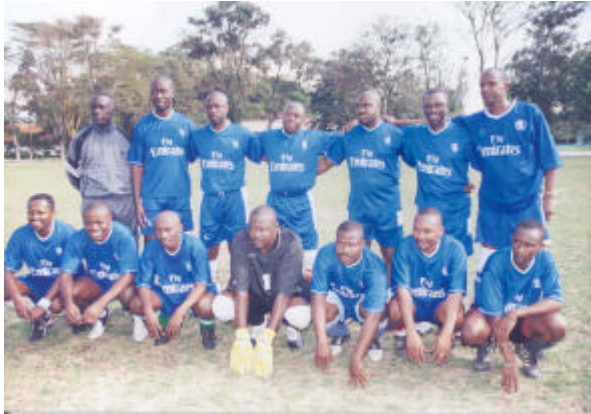
ICTR Arusha Team