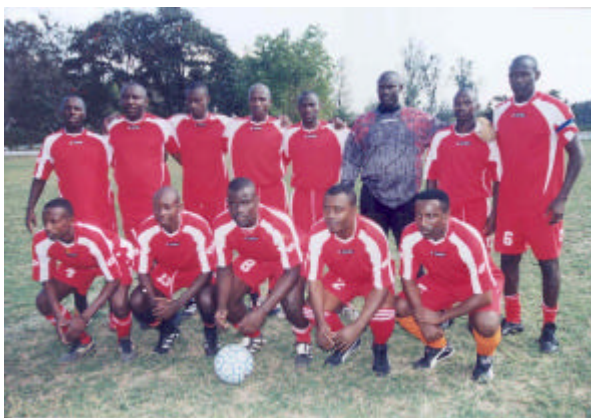
The Victors, ICTR Kigali Team

Other sporting events that took place on Saturday 22 October at the St. Constantine School grounds were: Table Tennis, Volleyball, Petanque, Darts and Football. It was the second time that the ICTR Arusha football team was playing against their Kigali counterparts. The Kigali team won the match, three goals to one.