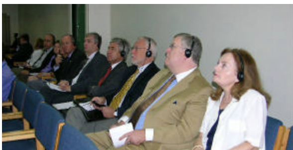
The Delegation attends a court session